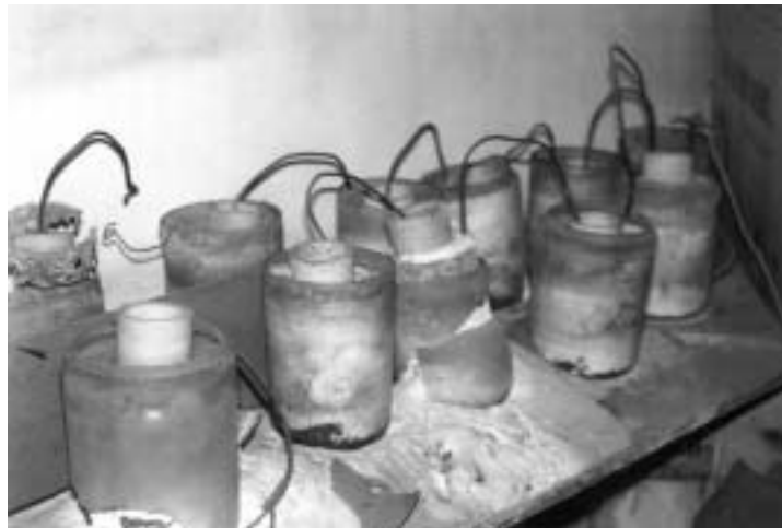
Figure 4 The battery of Candido's piles that powered the electrical tower-clocks of Lecce from 1868 to 1936, as found in 1990.

As regards the lead pile Balsamo states in his paper that his experiments to obtain colouring substances from the salification of lead had already begun in 1857 and in 1859 he had successfully experimented with 6 couples of a voltaic combination, devised for that purpose, on the underwater telegraphic link of more than 100 kms between Lecce and Valona, in Albania. The paper records next a detailed description of the various experiments carried out using numerous substances and different combinations.